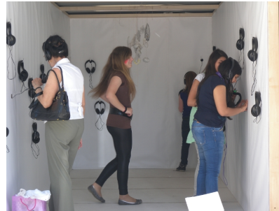
Search-Touch-Listen-Room

There is nothing like „the“ history. History is always fragmental and dependent on what I look for, what I can find, what I already know and what I believe in. History is something in constant motion. The audio-exhibition within the container and its creation reflects this thought.