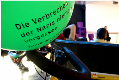
„Repolitisation! Talks about History Politik in Post-Nazism/ Gespräche zur Geschichtspolitik im Postnazismus“ trafo-k May 11th 2011 Photo Werner Prokop 2011