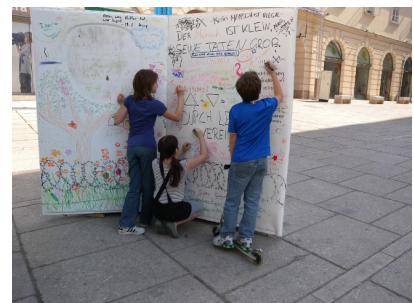
Workshop with Gymnasium 19 held by