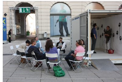
Classmeeting Object Sculpture on May 18th 2011

The surface of the freestanding, star-shaped wall, the second part of the installation, is working with three layers of text. I will apply the first layer. The next layer will be applied by pupils during a workshop and the third layer visitors of the exhibition and others will apply. As the first layer consists of hidden words, written with lemon-ink that shall be made visible for its viewers through the ambivalent medium of fire – standing for destruction and renewal at the same time – it plays with the idea of some invisible, secret, forgotten and dangerous knowledge.