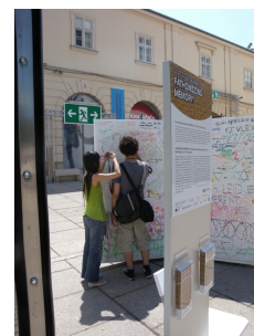
Visitors leave impressions on Starobject - third text layer is being created. Photo V. Nino Jaeger 2011