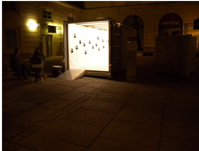
Search-Touch-Listen-Room At MQ, Vienna, May 2011

Although this decision has been made, the question, which testimonials to choose, hasn't been completely answered yet. It would be helpful to deepen the studies of further categories. As I refuse categories adamantly, I decided to be as frugal as possible with categories.