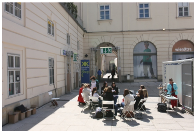
The installation as a space for workshops