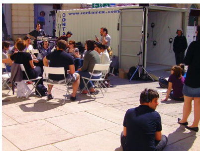
„Radio workshop: Voices of Remembrance / Radiowerkstatt: Stimmen der Erinnerung „

To come to an end, let me choose some final keywords: review this day and age!