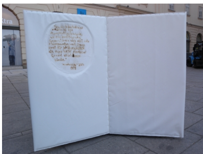
Starobject, first text layer: Knowledge and remembrance

The surface of the freestanding, star-shaped wall, the second part of the installation, is working with three layers of text. I will apply the first layer. The next layer will be applied by pupils during a workshop and the third layer visitors of the exhibition and others will apply. As the first layer consists of hidden words, written with lemon-ink that shall be made visible for its viewers through the ambivalent medium of fire – standing for destruction and renewal at the same time – it plays with the idea of some invisible, secret, forgotten and dangerous knowledge.