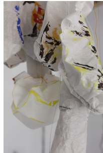
Bodies of Remembrance For 14 Roma forced laborers. Extras in the Leni Riefenstahl movie „Tiefeland“. Materials: Paper, straw, yarn, water colour, ink, typewriter printed names and dates of birth. Cues: Responsibility of artists, delicate human life.