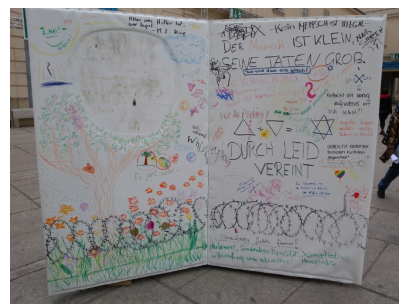
Starobject with three text layers.