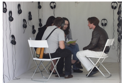
The installation as a space for discussion