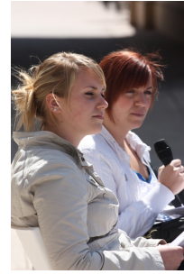
„Pupils on traces of the past - the School building Kenyonsgasse since 1938/ Eine Maruraklasse auf den Spuren der Vergangenheit - das Schulgebäude Kenyonsgasse seit 1938“ Verein Gedenkdienst Radio show May 6th 2011