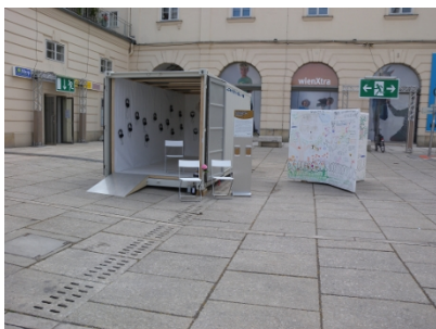
Installation Search-Touch-Listen-Room and Starobject