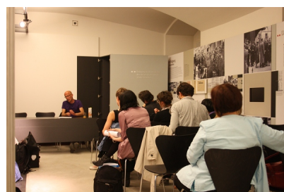
Lecture „Anti-Semitism because of Auschwitz?